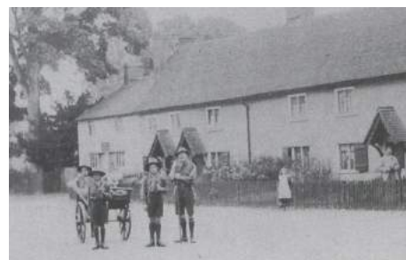
Boy Scouts and Scout Master in Rickling, 1915.

In the early 20 th century, a variety of clubs could be found in the village. A Mothers' Union, Women's Institute, Men's Society and Scouts held regular meetings, with a Horticulture Society and Flower Club catering for gardening enthusiasts. In the early 1900s a Coal Club and Shoe Club were set up, a weekly membership acting as a savings scheme for people. Sports clubs were also popular. In 1883, the village had an Archery and Tennis club, and the Tennis Club was